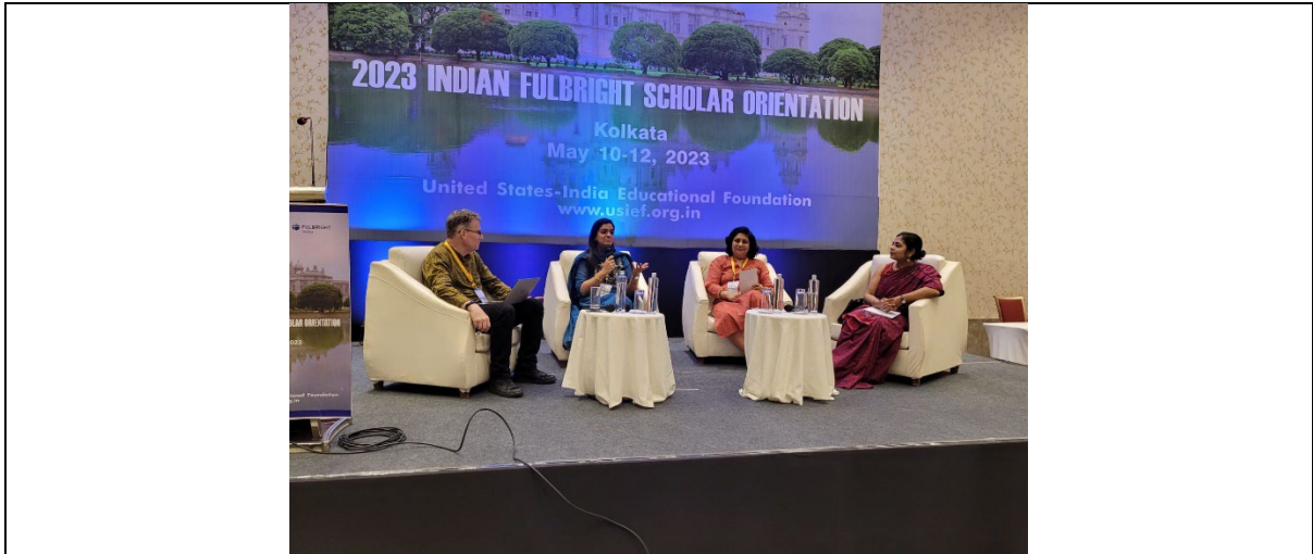
Experts at a panel discussion on “Living in the U.S.”

For the profiles of the Fulbright cohort visit https://www.usief.org.in/images/pdfs/E-PDO_Booklet_Kolkata_May_10-12-2023.pdf .